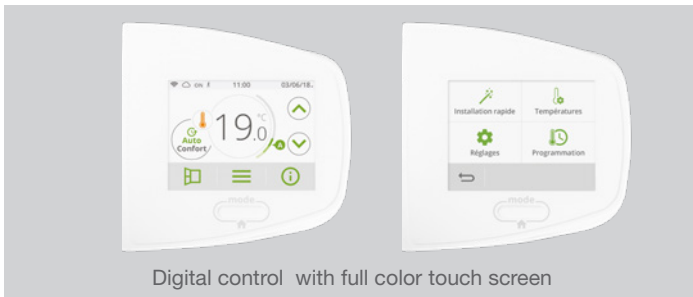
Digital control with full color touch screen